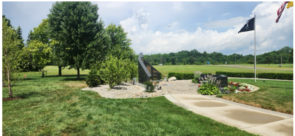
New Landscaping Behind The Memorial