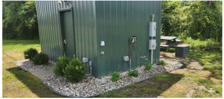
New Landscaping Around The Storage Barn