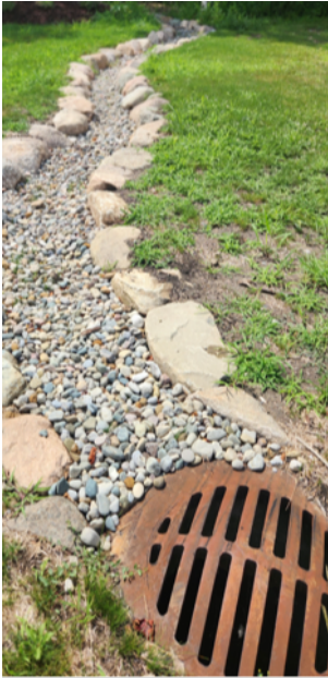
North End Reworked Drainage