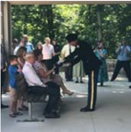
Presentation of Flag.