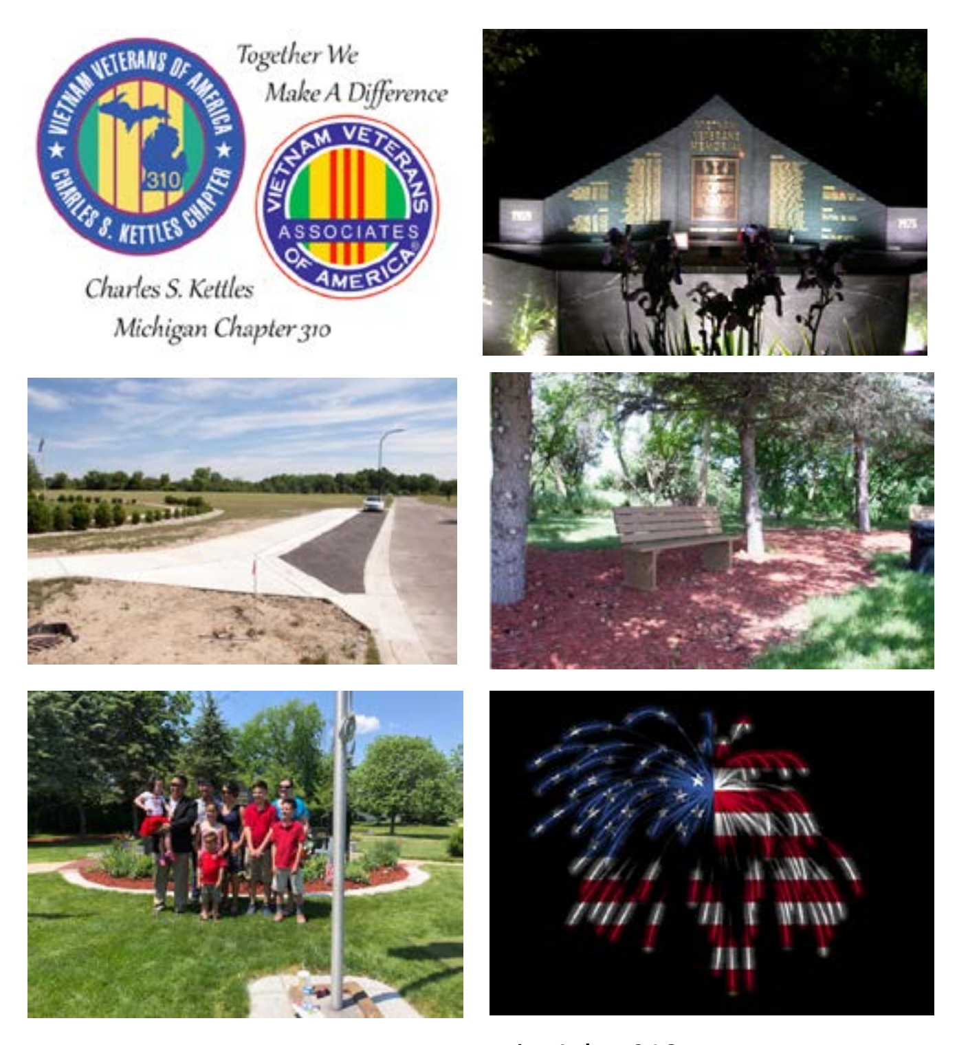
VVA 310 Dispatch July 2018

The months of June and July have brought celebrations, involvement with community, and service to Veterans. Work with the Memorial grounds continue. Good job, All!